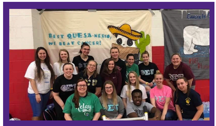
Theta Chapter (Mansfield University) sold quesadillas and won a prize at their campus's Relay for Life.