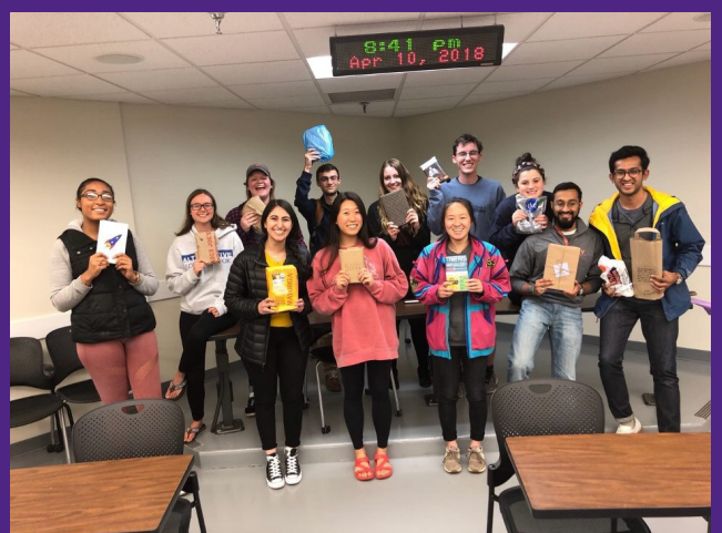
Alpha Omicron Chapter (University of Virginia) has a book swap between Members. They cover the books to add some mystery and attach a note to the reader.