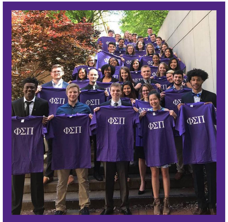
The founding class of the Eta Xi Chapter (University of North Carolina at Charlotte) learned all about what it takes to be an Ideal Brother during their first term as a Chapter.

No person in a position of authority is immune from criticism. You must learn to sort out the constructive (from which you can learn) from the malicious (which you must ignore).